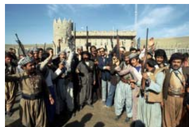
Kurdish Rebels, 1979