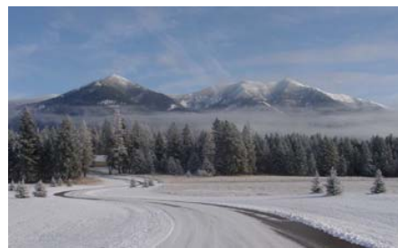
Winter in Montana, 2004

Wide-angle adapters for miniDV .50x, .70x ..... 10 Canon 3x wide-angle zoom for XL1/2 ..... 35 Canon MA-100 XLR audio adapter ..... 15 Canon VL-10 10w Light ..... 15 Sony HVL-20 20w Video Light ..... 15 Formatt 4x4 Matte Box ..... 35