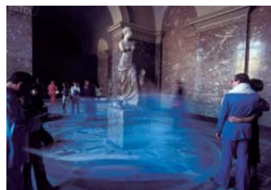
Venus at the Louvre, Paris, 1978

VIDEOSMITH® is the registered trademark of Videosmith, Inc. Copyright 2010.