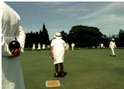
Zimbabwe Bowling, 1980