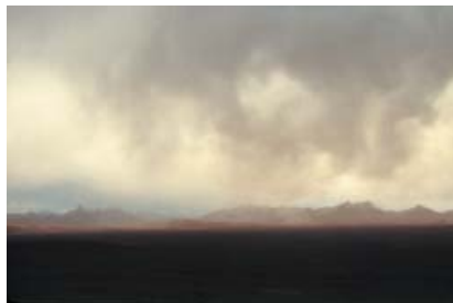
Iran Desert, 1979

SXS Card - 8gb ..... 25 SXS Card - 16gb ..... 50 PHU-60K External Hard Drive (60gb) ..... 75