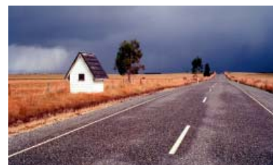
Otago, New Zealand, 1993

Gels (sheets and rolls for purchase) ..... inquire