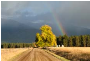
Autumn in Montana, 2006

Whether your shoot is just down the street or around the world, Videomsmith has the experience, the equipment, and the people to make it happen.